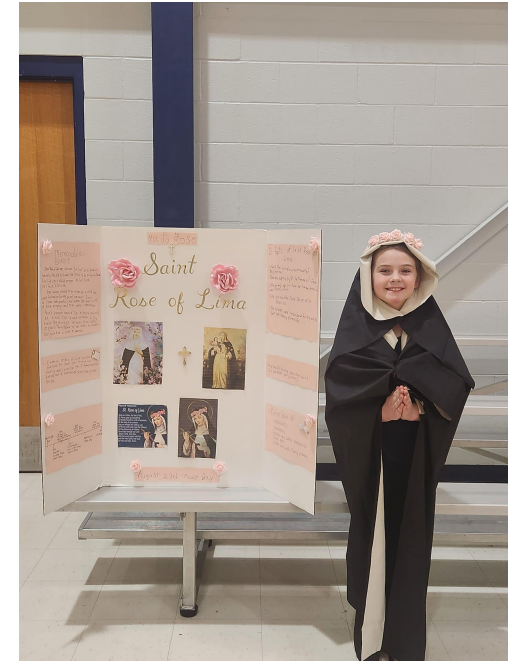
(above and below) 3rd Grade, samples of their Saint projects.