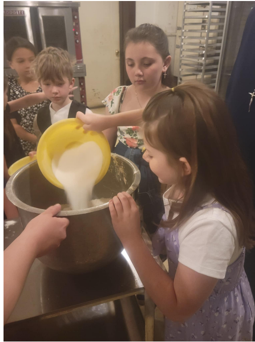
(above and below) 2nd Grade, First Communion Retreat

New this year! Incentives for different tiers of donations. Look at your packet for more info.