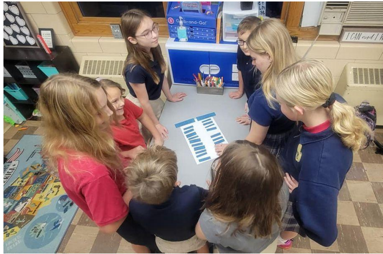
(above and below) Our Student Council, hard at work during their first meeting of the year.

Please remember to be volunteering frequently and to log your hours in FACTS when you do. When you do work toward your family's 20 hour requirement , you do so much more than check a box. You help us keep the school open and running, so we can offer a quality private, Catholic education at an affordable price!